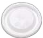
D76 Cold Drink Lid