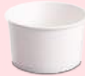
20 oz Yogurt / Soup Cup (750cc)