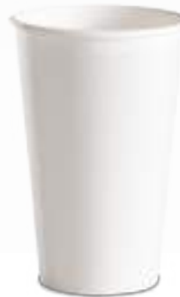
C700 Cold Drink Cup (700cc)