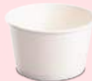
28 oz Yogurt / Soup Cup (850cc)