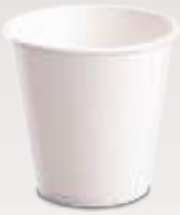
10oz Cold Drink Cup (360S)