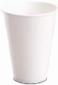
16oz Cold Drink Cup (A500)