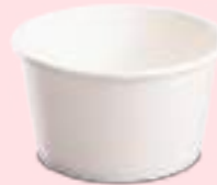
24 oz Yogurt / Soup Cup (780cc)