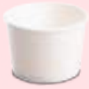
8 oz Yogurt / Soup Cup (260cc)