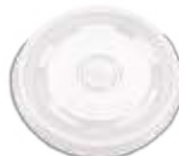
D95 Cold Drink Lid