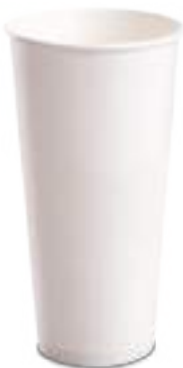
22oz Cold Drink Cup (A660)