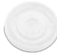
D90 Cold Drink Lid