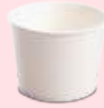
16 oz Yogurt / Soup Cup (520cc)