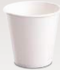
C360 Cold Drink Cup (360cc)