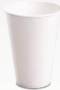
C500 Cold Drink Cup (500cc)