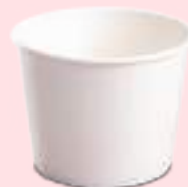
32 oz Yogurt / Soup Cup (1000cc)