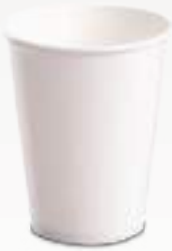
12oz Cold Drink Cup (A400)